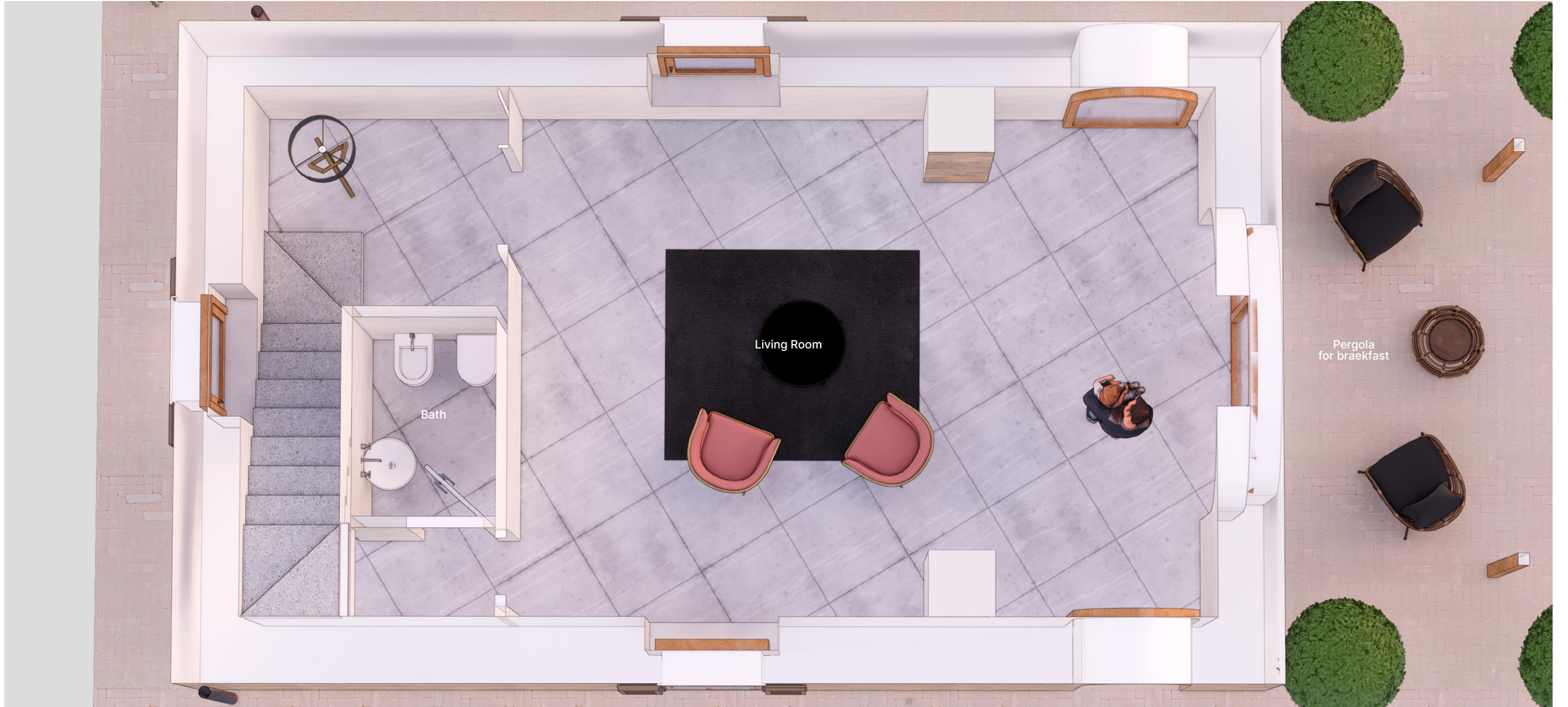
Ground Floor Annex